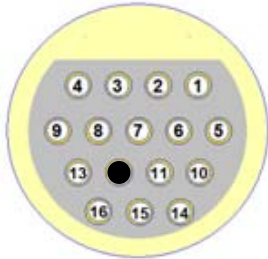
Omnetics 16-pin (male) A18462-001 (Rear View)